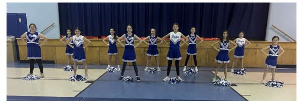
Our cheer squad had a great first practice! They dusted off SME's uniforms and are preparing to cheer on our boys during their home games!

Who Do You Know? As we prepare for the upcoming Mega Raffle, we are reaching out to the wonderful families in our school for support. If your family has any connections or if you know of any businesses or individuals who might be interested in contributing, we would be incredibly grateful for any raffle donations. These contributions can come in various forms such as gift cards, merchandise, services, or any other items suitable for our raffle. Your support not only enhances the excitement of our event, but also plays a crucial role in achieving our fund-raising goals. If you have any leads please contact the Mega Raffle Committee at megaffle@smeschool.com for an official donation/sponsorship letter.